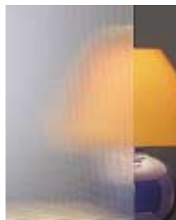
Satinlite Low Iron