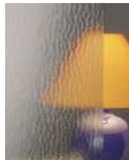
New Cathedral Bronze