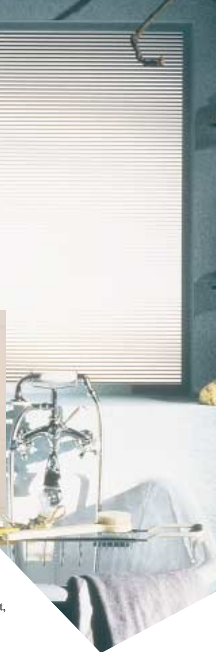
▲ Narrow Reeded