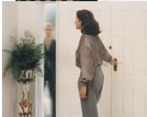
▲ New Cathedral

Today's Pilkington Texture glass is not just for those old established privacy uses in shower screens and doors. With a scintillating range of Pilkington Texture and wired glass, you now have many 'whole of house' options to consider – from door inserts and wall panels to shelving, balustrades and partitions. Or look at wall cladding, leadlighting and louvres – even benchtops and splashbacks or glass-topped furniture. There are no rules. Pilkington texture glass can lighten and brighten your life in so many beautiful ways.